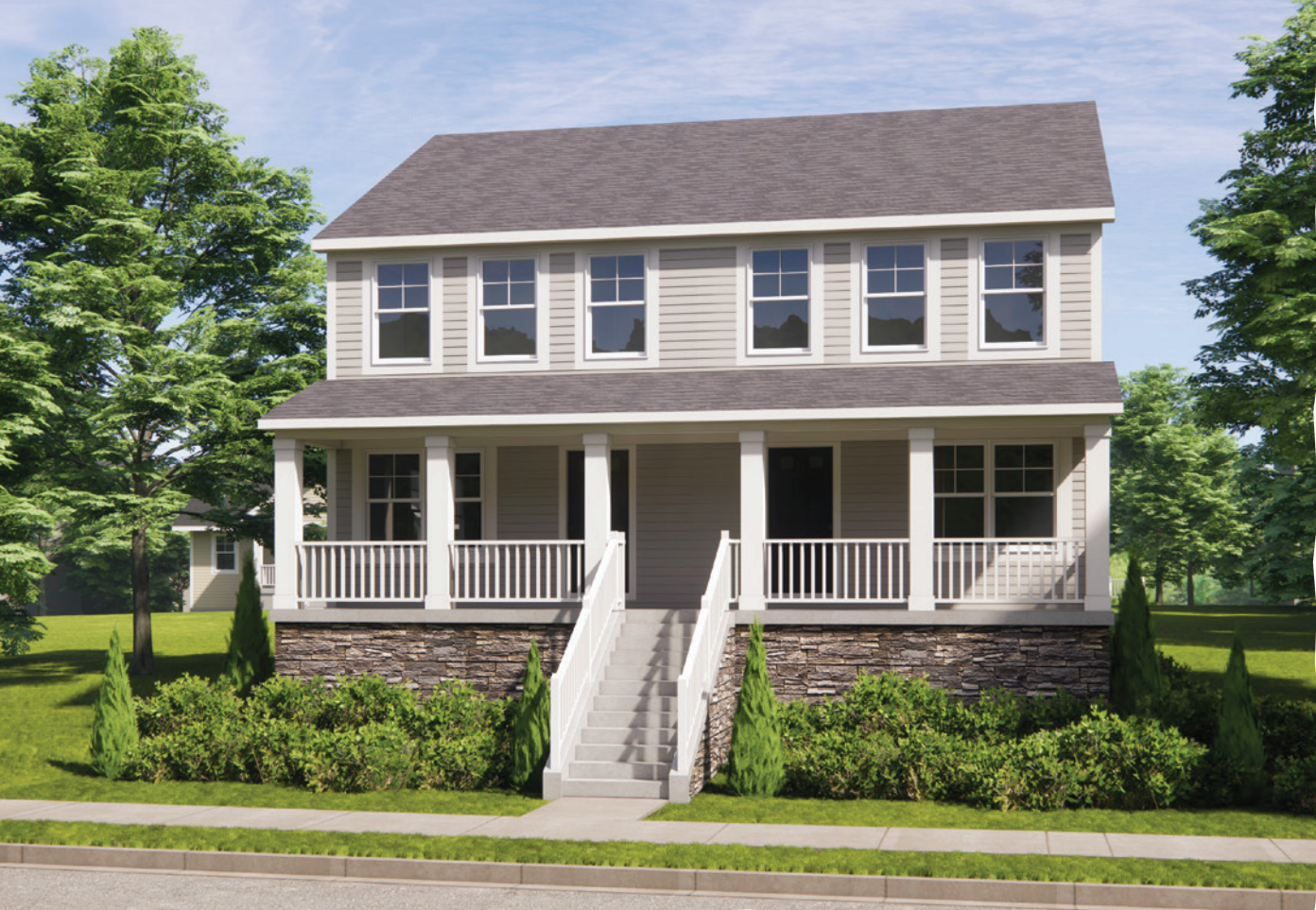
Rendering of FROM's proposed duplex.