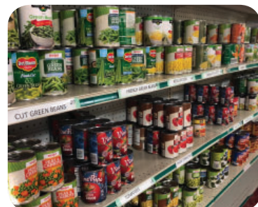
The Food Pantry offers canned, fresh, frozen and refrigerated items.